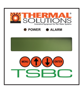
Thermal Solutions Boiler Control (TSBC)